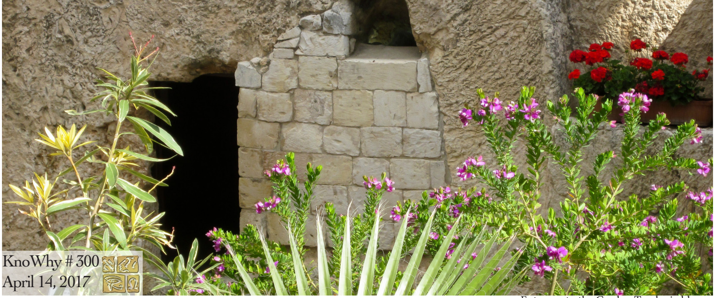
Entrance to the Garden Tomb