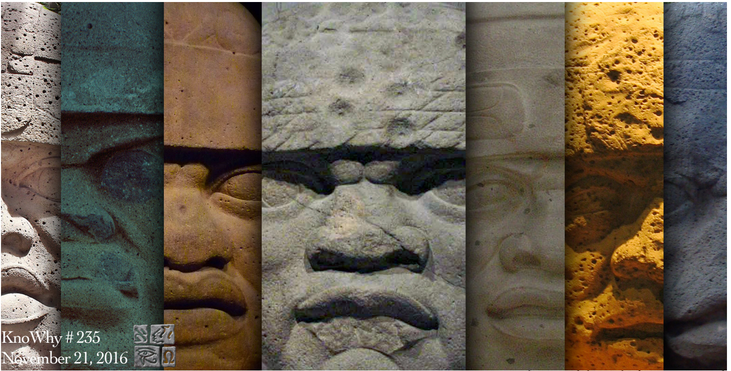
Olmec Heads by Book of Mormon Central